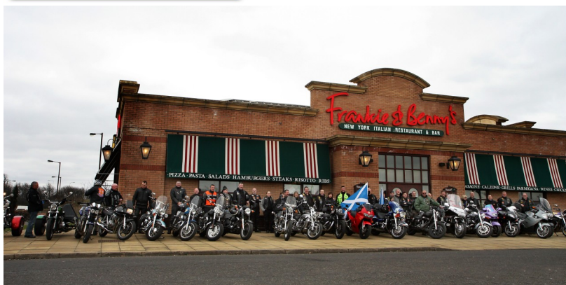
Forth Gear Easter Egg Run breakfast, Frankie and Benny's, Sth Queensferry